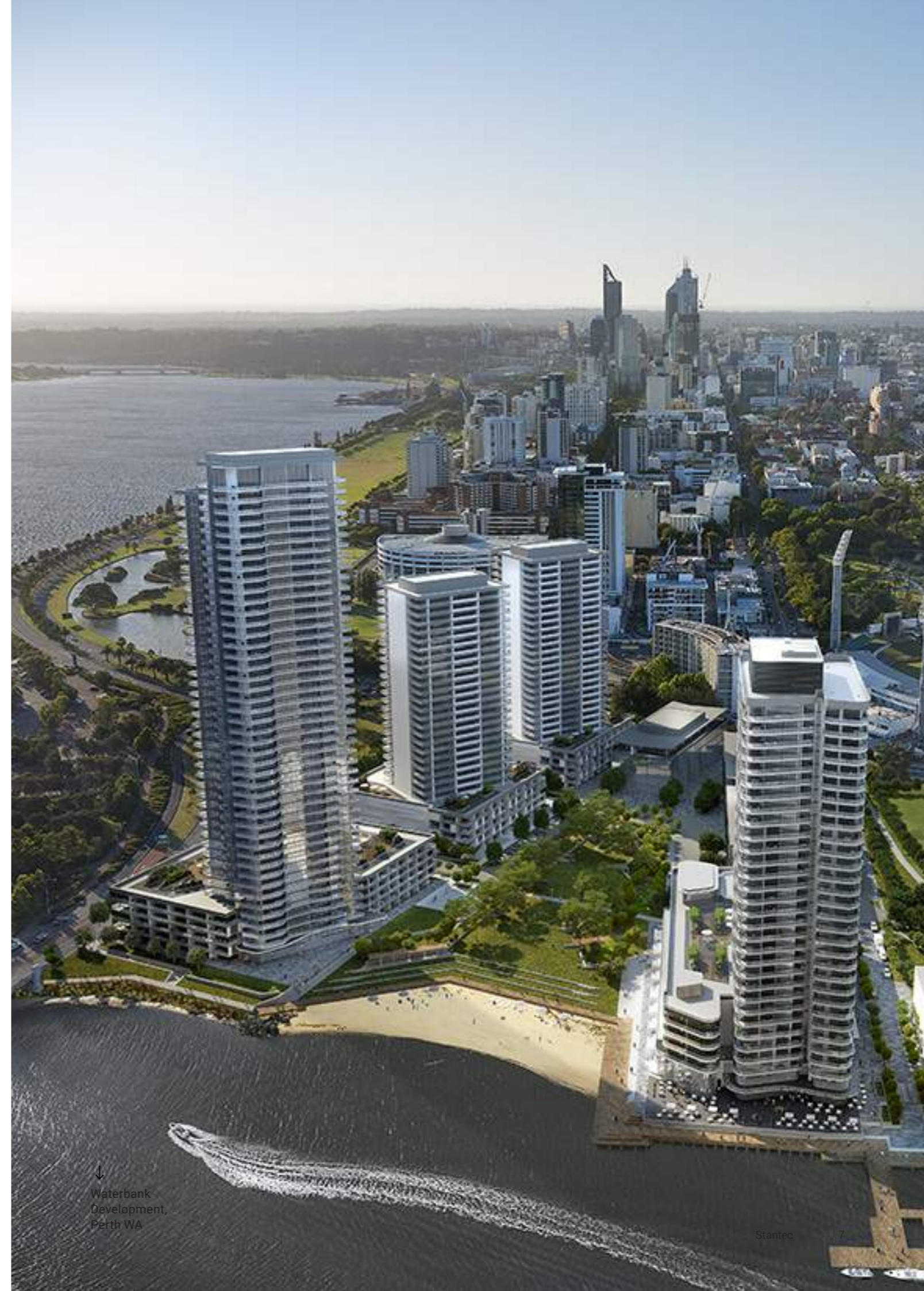
↓ Waterbank Development, Perth WA